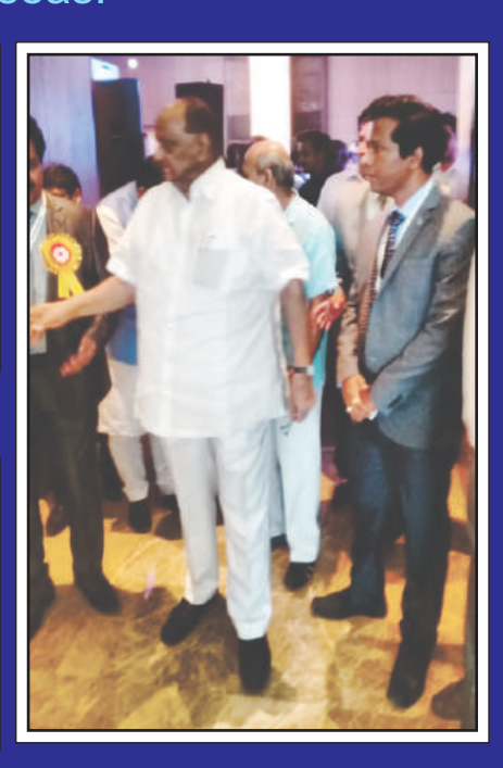
STAI, NEW DELHI 2016